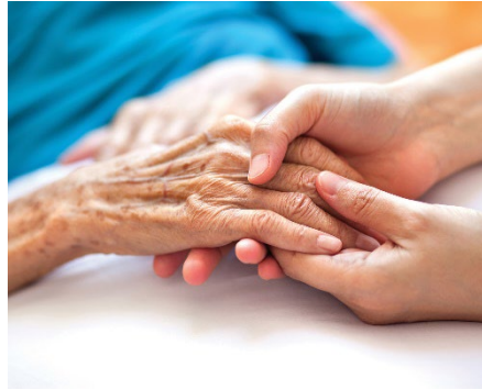
Care for a family member with a serious health condition