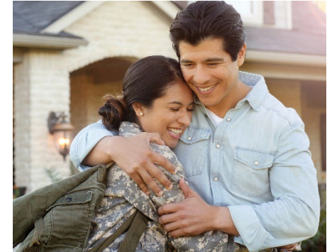
Assist loved ones when a family member is deployed abroad