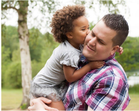
Bond with a new child

Paid Family Leave is insurance fully funded by employees It provides paid time off and job protection for employees to: