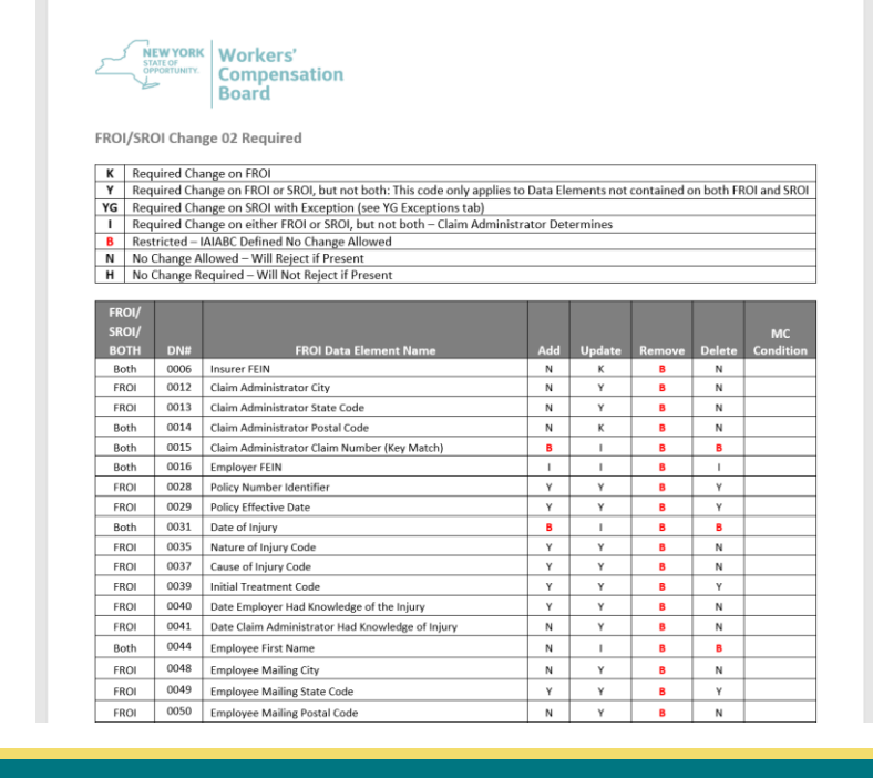
Chart of DNs Triggered on 02