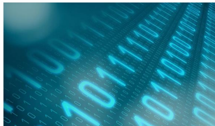
NY Requirement Tables